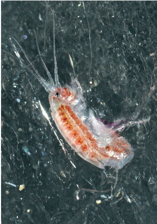
Figure 1. In situ Apherusa glacialis from sea-ice.