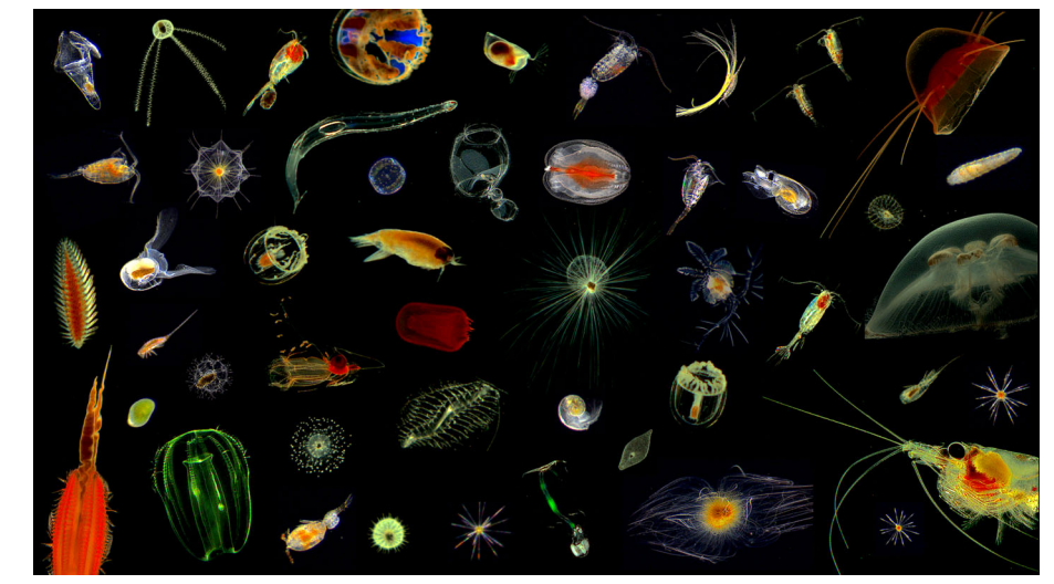
FIG. 1. In situ images of plankton species from the North and South Atlantic.

The Marine Biodiversity Observation Network (MBON; https://geobon.org/bons/ thematic-bon/mbon/, last accessed date: 22 Dec 2021), with the support of the Modelling Different Components of Marine Plankton